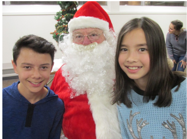
Santa visits with Vonheim children (more photos on facebook)